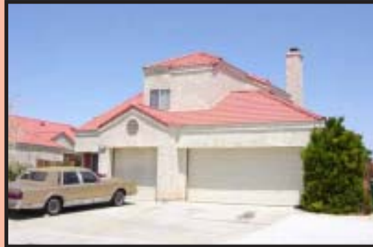
4025 Kona Ct $200,000 3 Bedrooms, 3 baths, Size: 1739 sq.ft Priced to sell. 3 bedrooms, 3 baths, two stories, and enclosed patio. (Listing 8292, Doc Davis)