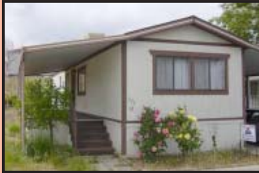
40701 Rancho Vista #277 Blvd $32000 2 Bedrooms, 1 baths, 784 sq.ft Nice home ready for small family. Two Bedroom and 1 bath. Cute and affordable. This is ready for a fast sale. (Listing 8284, J. Gardner)