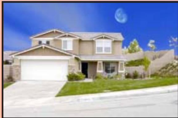
38602 Annette Avenue $254900 3 Bedrooms, 2 baths, 2344 sq.ft Great location with wonderful view of hills of Palmdale. Large open kitchen (Listing 8281, T. Hoeft)