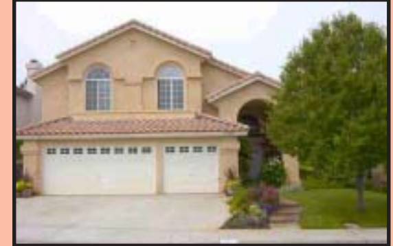
39919 Verona Lane $349,900 5 Bedrooms, 3 baths 3088 sq.ft Beautiful 5+3+office 3088 sq.ft.Rancho Vista home in Brock Estates. (Listing 8293, J. Gardner)